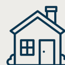
Owner Occupied Property